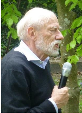
Philip Jackson in his garden at Cocking